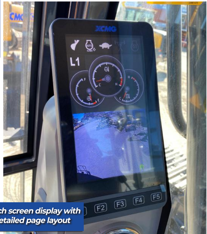
8 inch screen display with detailed page layout