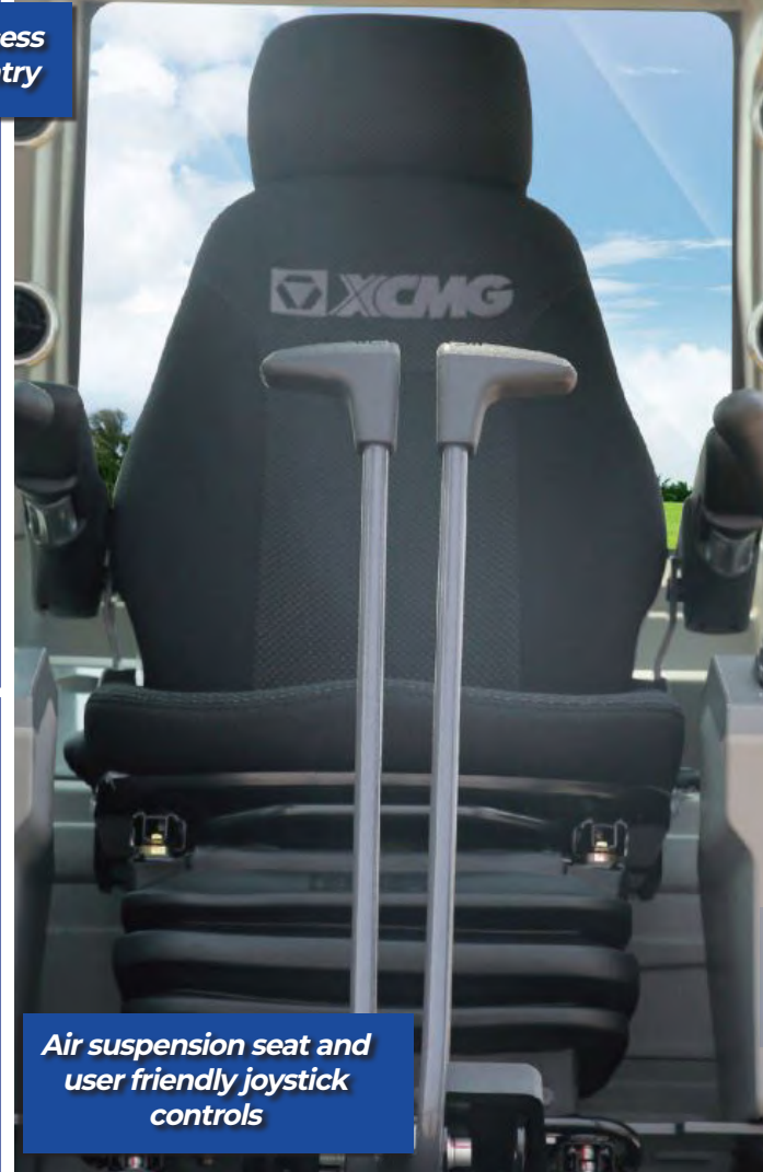
Air suspension seat and user friendly joystick controls