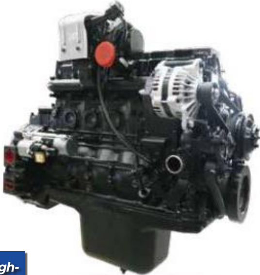
Low emission and high-torque engine