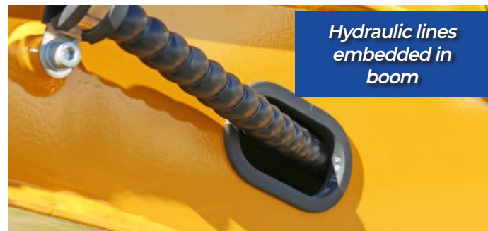
Hydraulic lines embedded in boom