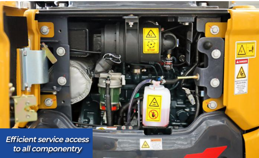
Efficient service access to all componentry