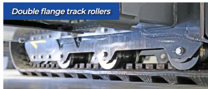
Double flange track rollers