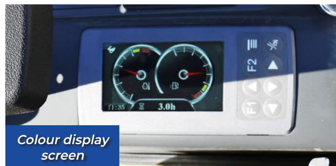
Colour display screen