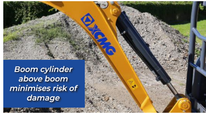
Boom cylinder above boom minimises risk of damage