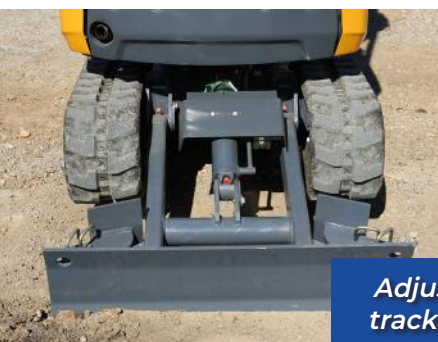
Adjustable track width