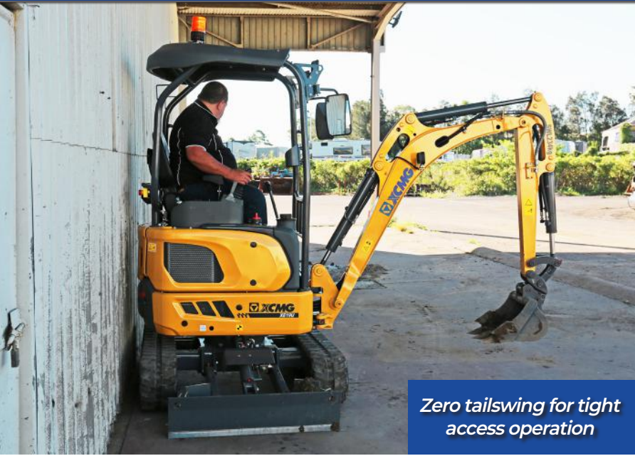
Zero tailswing for tight access operation