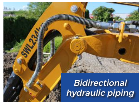
Bidirectional hydraulic piping