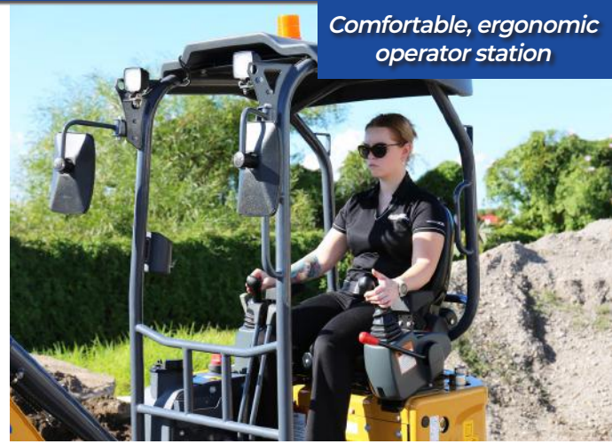
Comfortable, ergonomic operator station