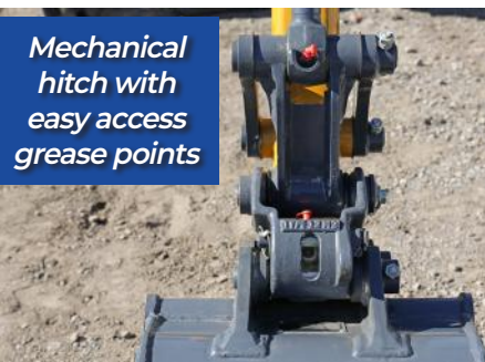
Mechanical hitch with easy access grease points